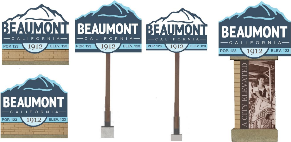
Figure 1 - Population and Wayfinder Design Concepts