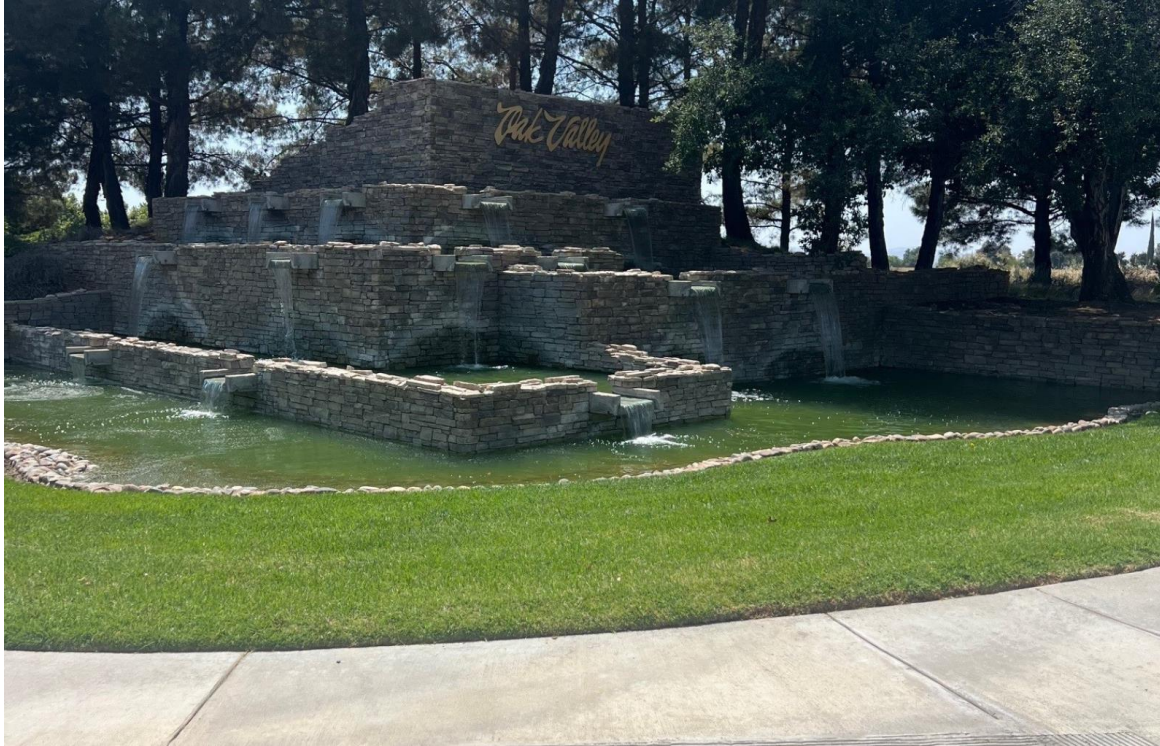
Figure 2 – Entry Water Feature