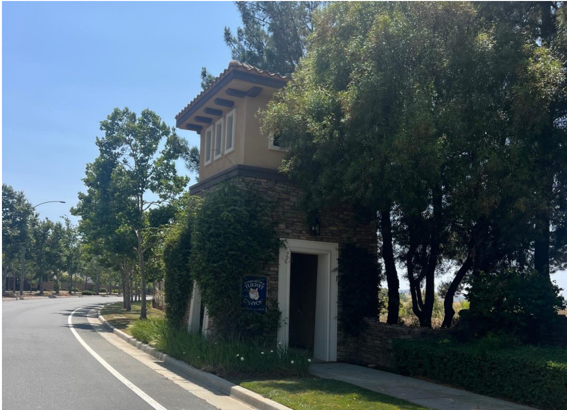
Figure 3 – Entry Monument