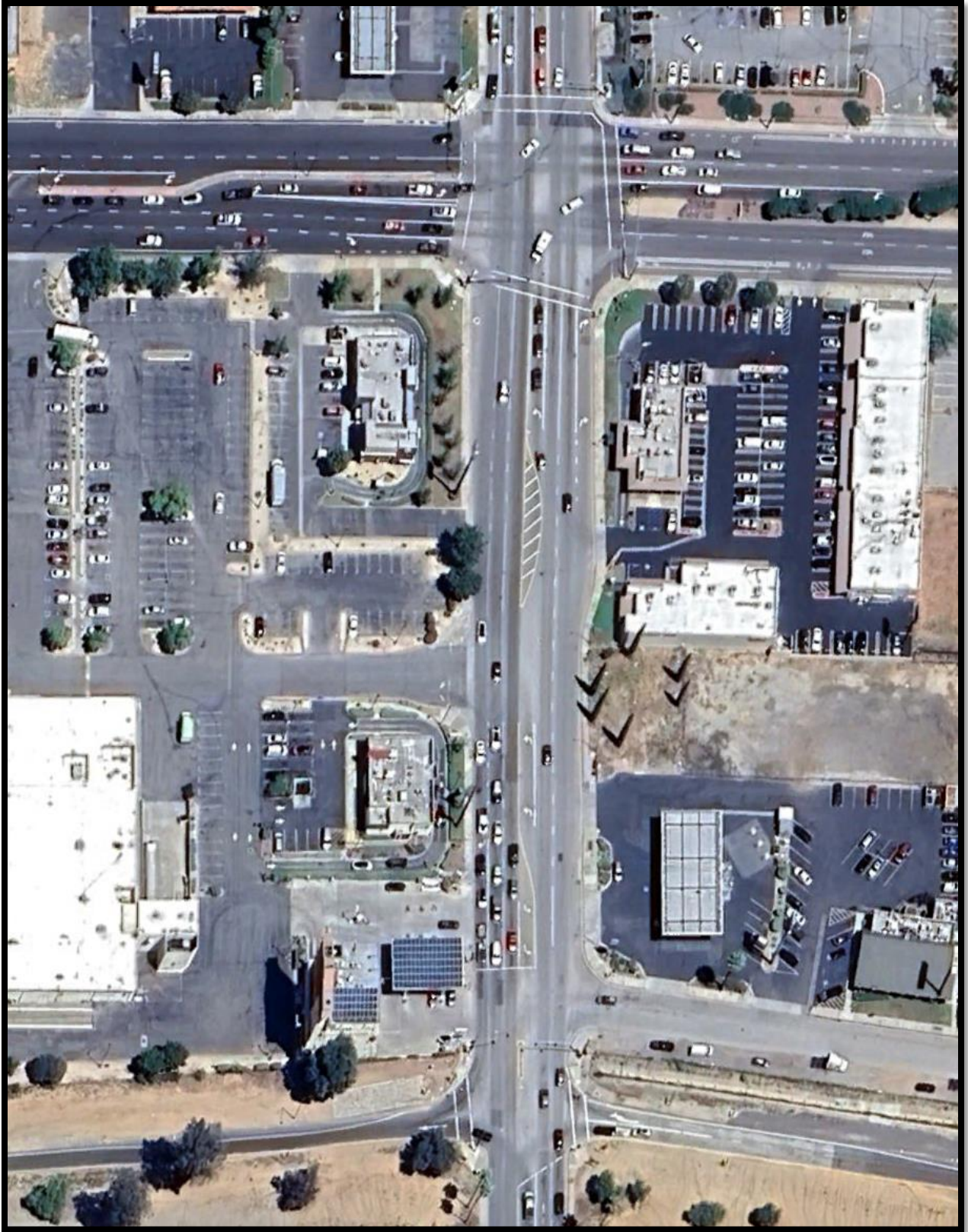
Figure 1 - Existing Highland Springs Avenue Median