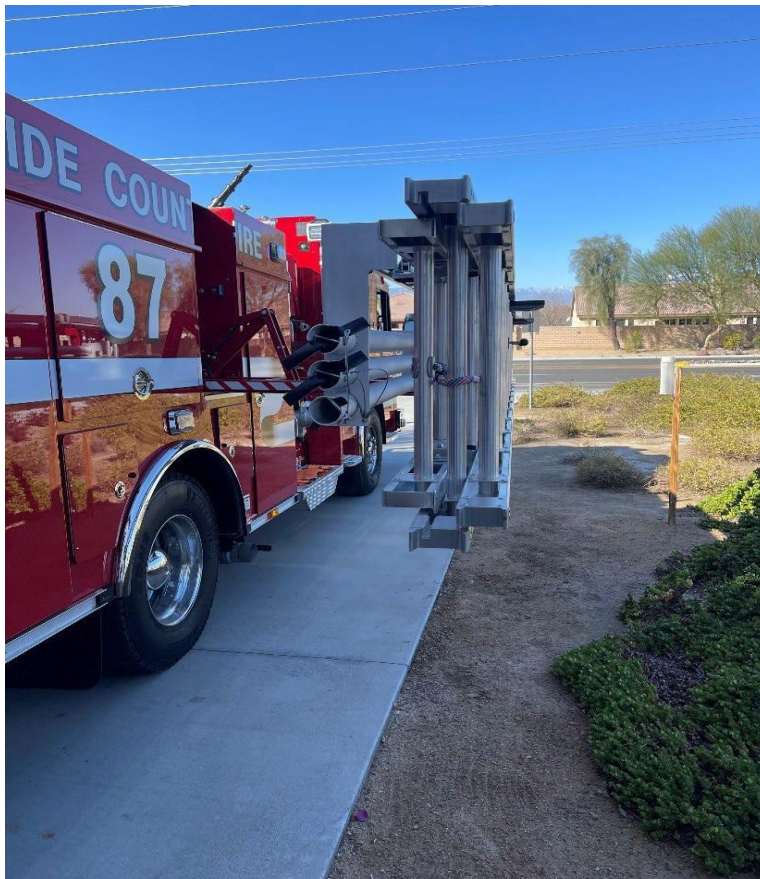
Figure 6. Ladder Rack