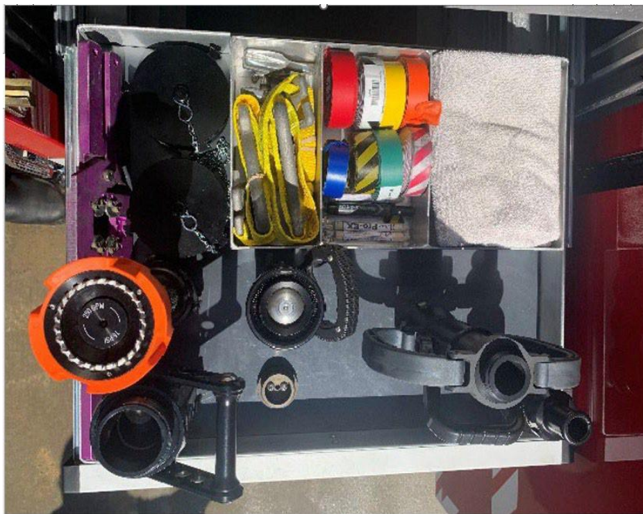
Figure 2. L-1 Brass Compartment – Top Drawer