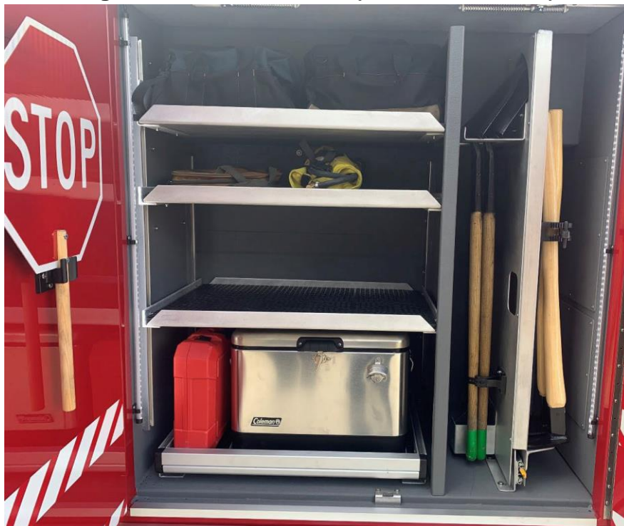
Figure 4. L-3 Rear Compartment