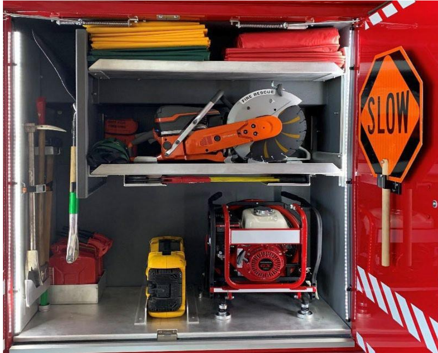
Figure 5. R-3 Rear Compartment