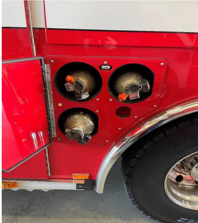
Figure 3. Wheel Well Left (SCBA Air Bottles)