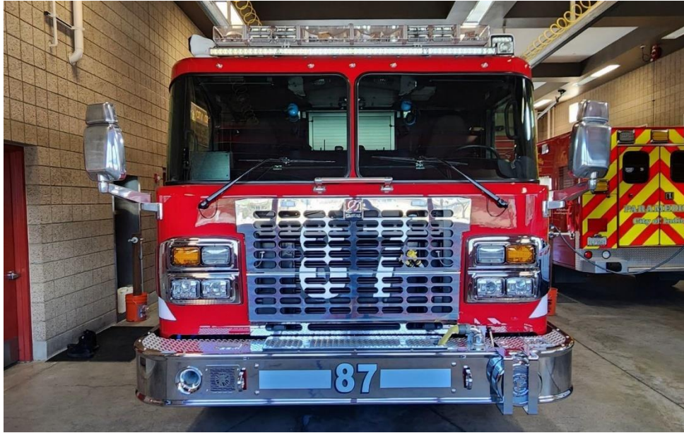
Figure 1. Smeal Type I Engine