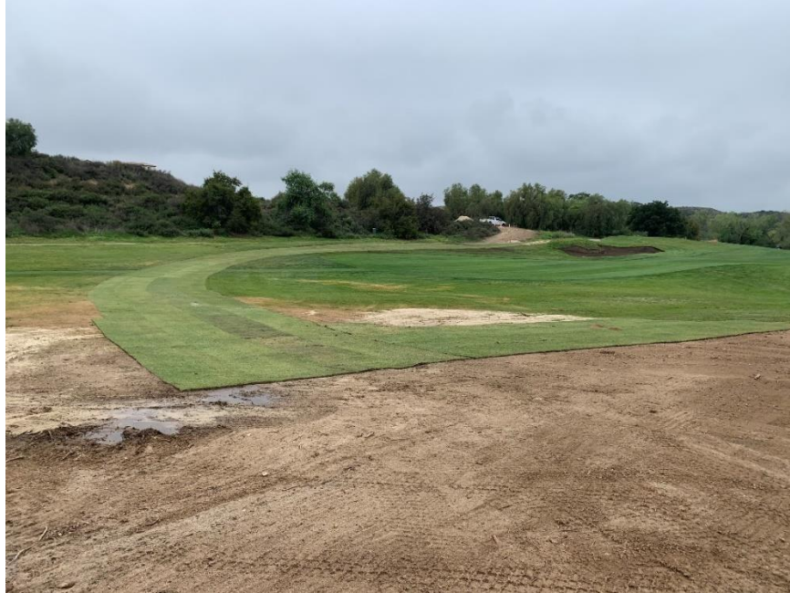
Figure 2 – New Sod

Labor and material costs are being tracked to identify further expenses. A future budget amendment may be necessary to support ongoing emergency response and repair efforts.