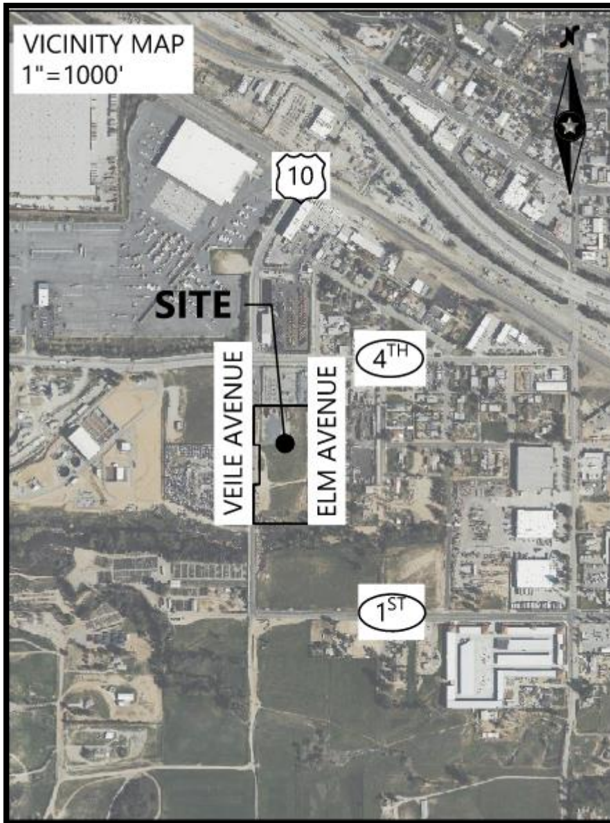
Figure 2 - Vicinity Map